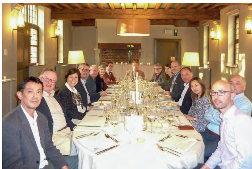
> Dinner after ISHS Board meeting in Leuven (2015).

I became a member of ISHS when I attended the International Horticultural Congress in Florence, Italy. Soon after, I started my job as an assistant professor at Kyoto University.